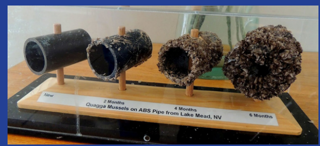
Quagga Mussels on ABS pipe from Lake Mead, NV.

Thanks for being a responsible boater, have a safe and enjoyable season!